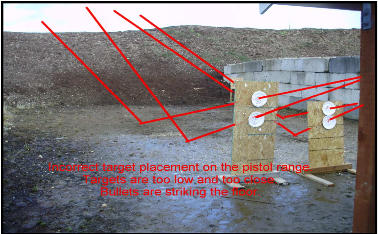
Figure 3. Red lines represent bullet trajectory, and probable ricochets.