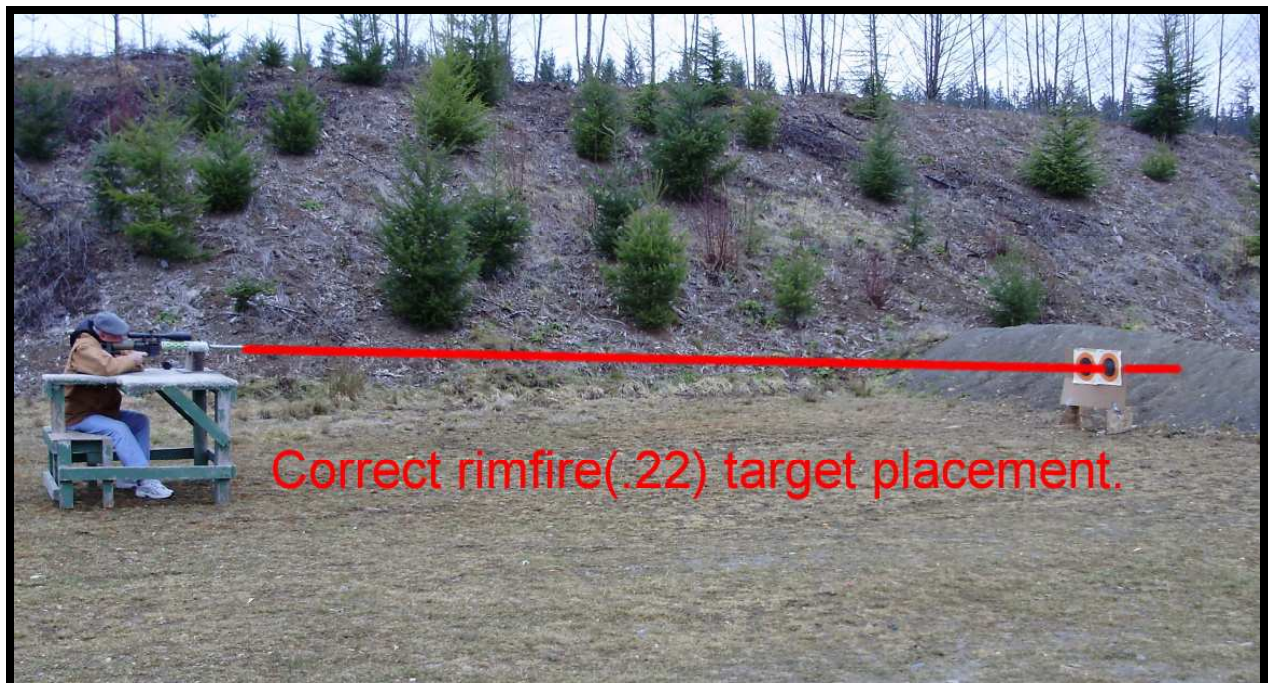
Figure 6. Red line represents approximate bullet trajectory.

Figure 6 represents a properly placed target for .22 rimfire on the C-range. Again, the bench is forward of the shed simply for illustrative purposes. This is the CORRECT target location.