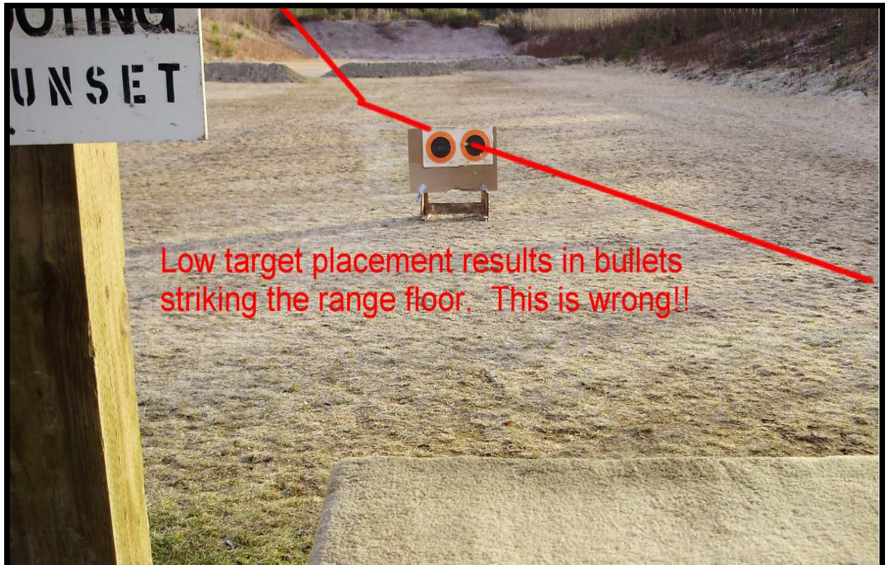
Figure 2. Red line represents approximate bullet trajectory.

Figures 2 and 3 represent targets at an improper distance and height. The trajectory of the bullet will strike the range floor with a strong probability of ricochet. Figures 2 and 3. are the WRONG placement!