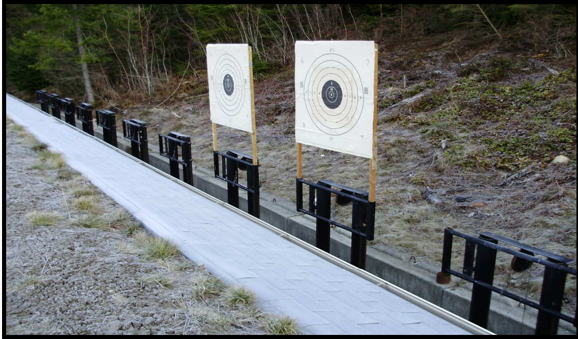
Figure 7. Target in a target carrier on the D-range.

Targets on the D-range (600 yd rifle) are to be placed in the target carriers only (Figures 7 and 8)! Nowhere else! There will be NO targets on the D-range floor in front of 200 yard shed, no targets on the 300 and 500 yard shooting positions, and no targets between the 600 yard shed and the 500 yard shooting position. All members must successfully complete a shooting test in order to use the 500-600 yd shooting positions on the D-range, or possess a NRA Highpower Rifle, or NRA Blackpowder Cartridge classification card.