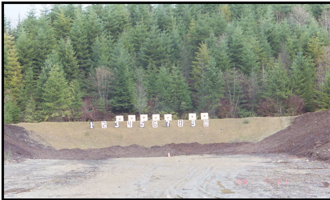
Figure 8. Targets in the target carriers, and number boards as viewed from the 200 yard firing line shed on the D-range.