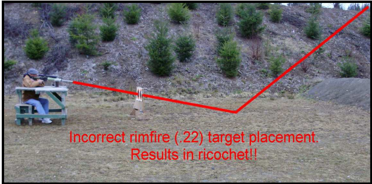
Figure 5. Red line represents approximate bullet trajectory and a ricochet.

Figure 5 represents an incorrectly placed target for .22s on the C-range. Bear in mind that the shooting bench in the photo is well ahead of the shooting shed. This is simply for the purposes of illustration. One can clearly see that if shooting in this situation, the bullet will strike the floor and most likely result in a ricochet. This is the WRONG target location.